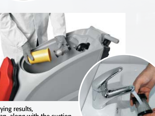
To obtain excellent cleaning and drying results, it is important to keep the filter clean, along with the suction hose connected to the squeegee