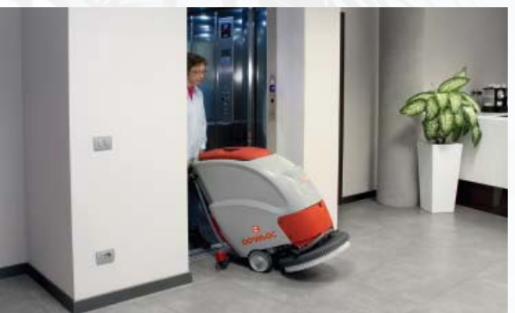
L2O/22 B-E is fitted with a new squeegee in a reinforced (Patent Pending) plastic material that is corrosion resistant. The automatic uncoupling system protects the squeegee when accidentally impacted.