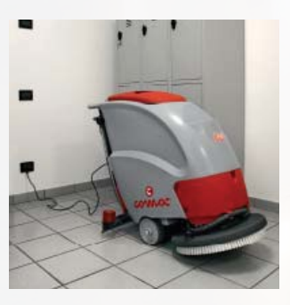
On request, the L20/22 B can be fitted with on board battery charger, so that recharging operations are quick and simple to perform