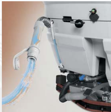
The special design of the recovery tank, and the large diameter of the drainage tube mean the dirty water can be completely drained without leaving any type of residue and in A VERY SHORT TIME