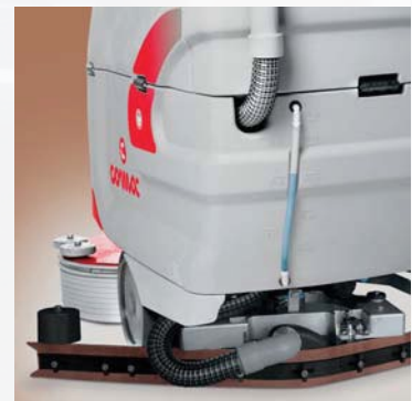
A handy little tube installed at the rear means you can always keep an eye on the level of clean water in the tank