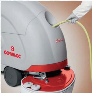
The wide inlet allows it to be quickly filled with water

In addition, their technical and design expedients help to make the machine extremely practical and reliable.