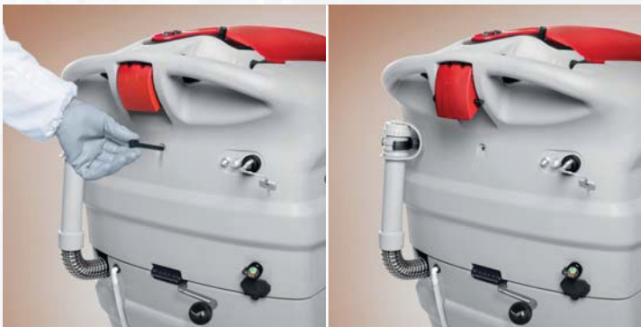
Maximum safety, with the interesting new solution applied to the Media parking brake