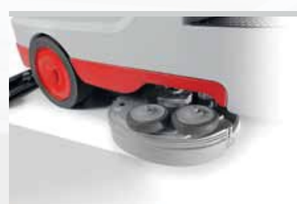
The brush pressure can be adjusted up to 100 Kg for hard cleaning