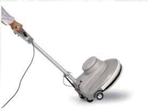
For easy transport, just tilt the machine back on the rear wheels and push it