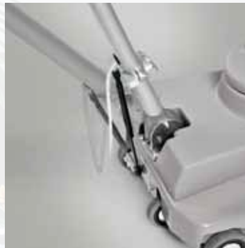
Gas spring assisted system which ensures disc pressure on the floor is kept constant regardless of the drive handle position. In this way the surface does not get burned or damaged