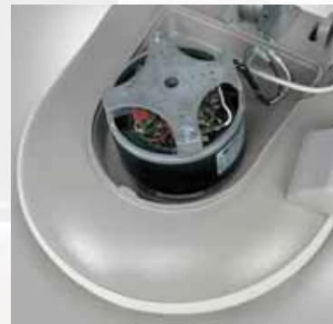
Very powerful, heavy-duty motor with rpm adjustment according to the machine strain