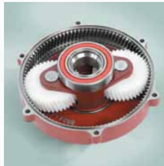
CM43f - CM50 Nylon gear box for long life, high reliability and quiet operation