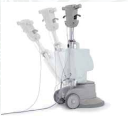
The operator can adjust the handle at any of the preset levels for best operating posture