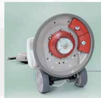
Controlled weight distribution for good balance so that use without causing operator fatigue is ensured