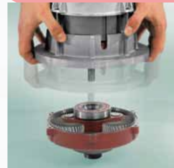
CM43f plus - CM50 plus Steel gearbox for demanding cleaning tasks in extraordinary conditions