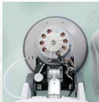
Powerful and heavy-duty motors (up to 2 Hp)