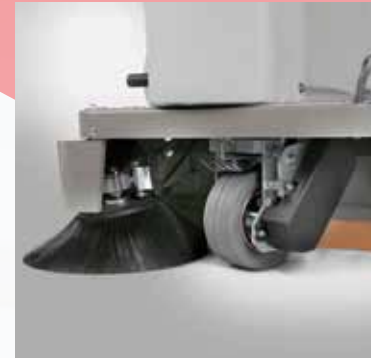
The front wheel drive system provides excellent manoeuvrability during operation